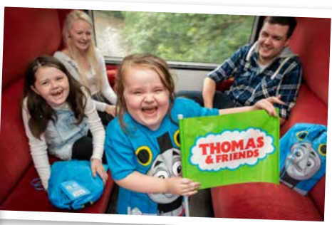
Day Out with Thomas 30 April, 1-2 May** Calling all little engineers! Join Thomas for a train ride unlike any other. Ride behind the little blue engine, meet Sir Topham Hatt, enjoy balloon modellers and much more.