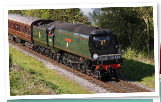
Spring Steam Gala 25-27 February* The ELR's Spring Steam bonanza makes a triumphant return in 2022. Join our home fleet for regular steam only services.